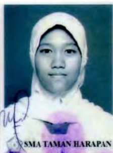
SMA TAMAN HARAPAN

dari satuan pendidikan berdasarkan hasil Ujian Nasional dan Ujian Sekolah serta telah memenuhi seluruh kriteria sesuai dengan peraturan perundang-undangan.